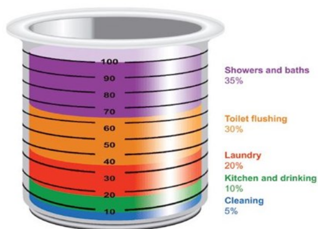
Water use in the home

How domestic water use is divided in Canada (Environment Canada, 2013)